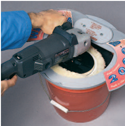
Mount soiled pad on buffer and insert into System 2000™