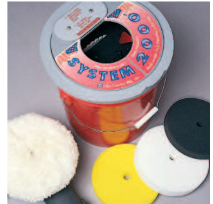
Remove from System 2000™