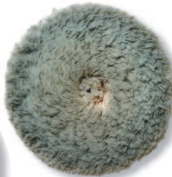
Wool Before ... and After