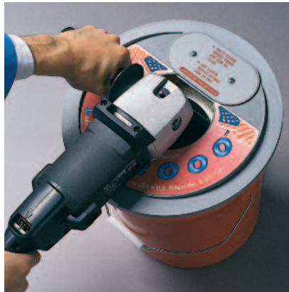
Run buffer for 30 seconds