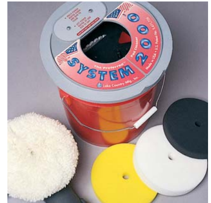
Remove from System 2000™