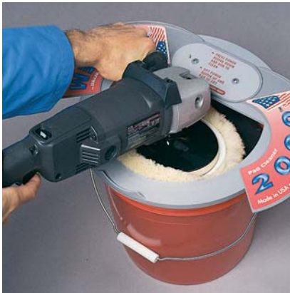
Mount soiled pad on buffer and insert into System 2000™