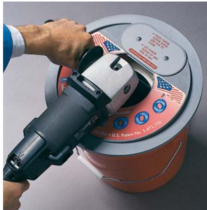
Run buffer for 30 seconds