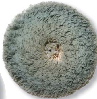
Wool Before ... and After