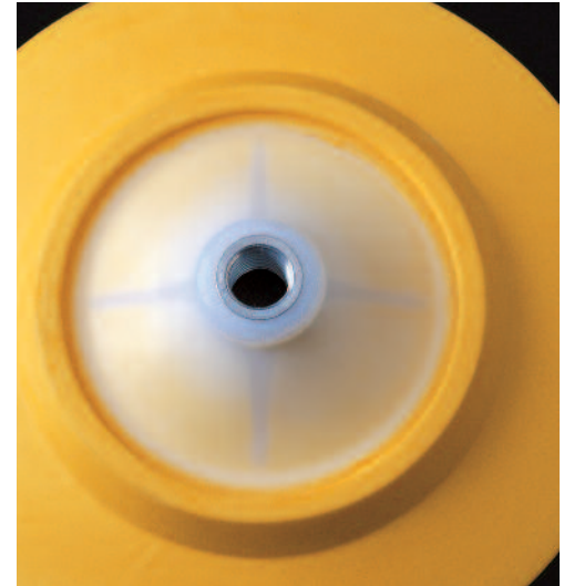
Reinforced with steel struts