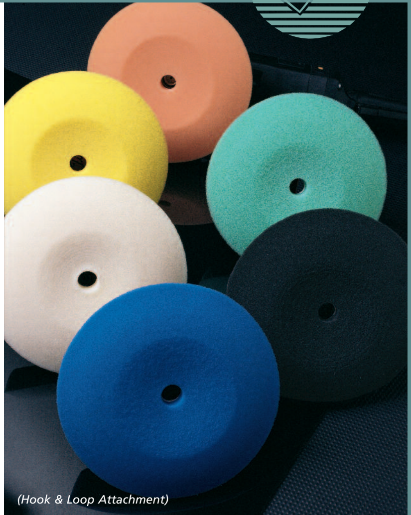
(Hook & Loop Attachment)

SEE REVERSE SIDE FOR FEATURES & BENEFITS